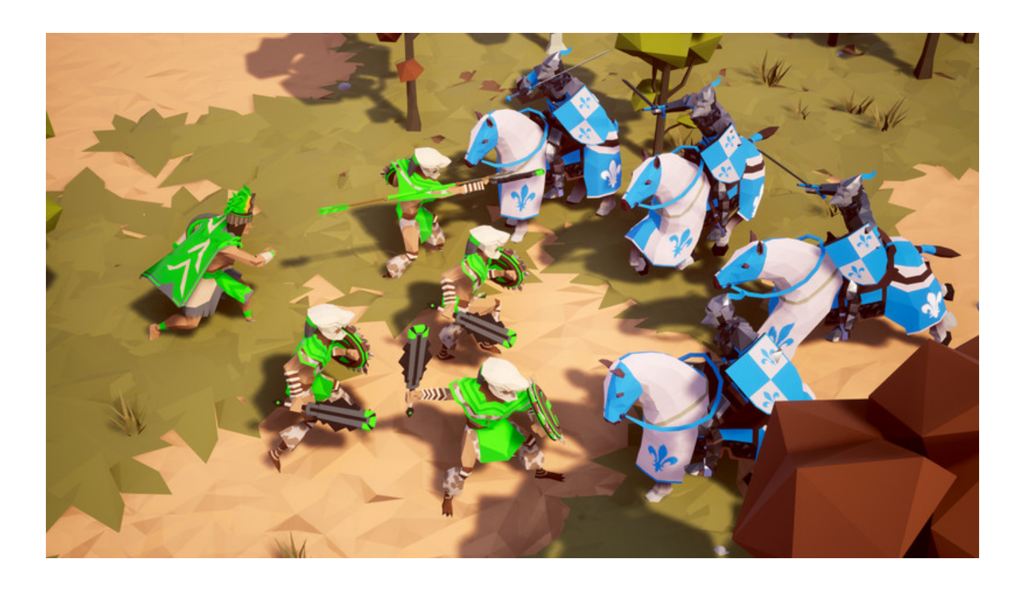
Empires Apart - Aztec Civilization Pack Download For Pc [Patch]

Download ->>> <a href="http://bit.lv/2NSFOdk">http://bit.lv/2NSFOdk</a>